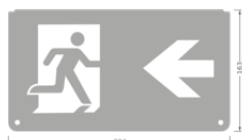
EM EXIT PICTO LEFT RIGHT