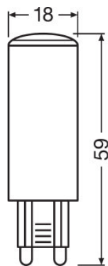
SST PIN 40 4.4 W/2700K G9