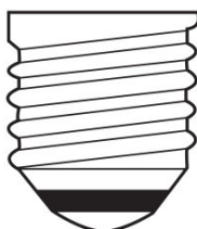
E27 IEC 7004-21