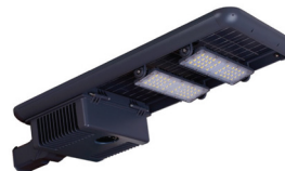
LED Solar Street Lighting