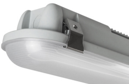
LED Weatherproof Battens