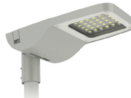
Theseus Range (Street Lighting)