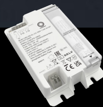
EMERGENCY KIT (includes Battery)