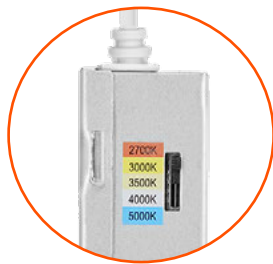
CCT selectable via a switch on the driver